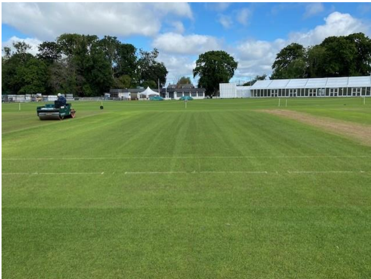
Centre wickets – 1 August