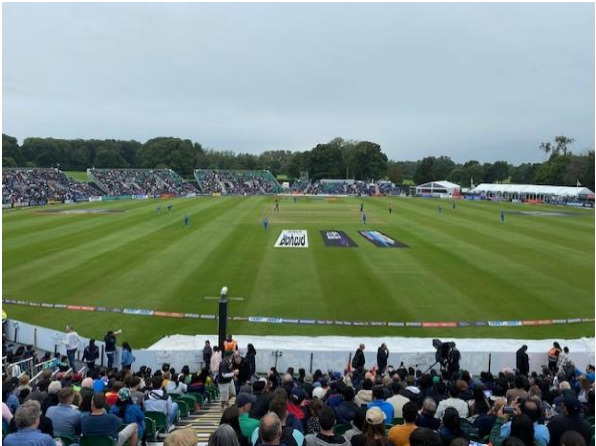
Ireland v India – 18 August