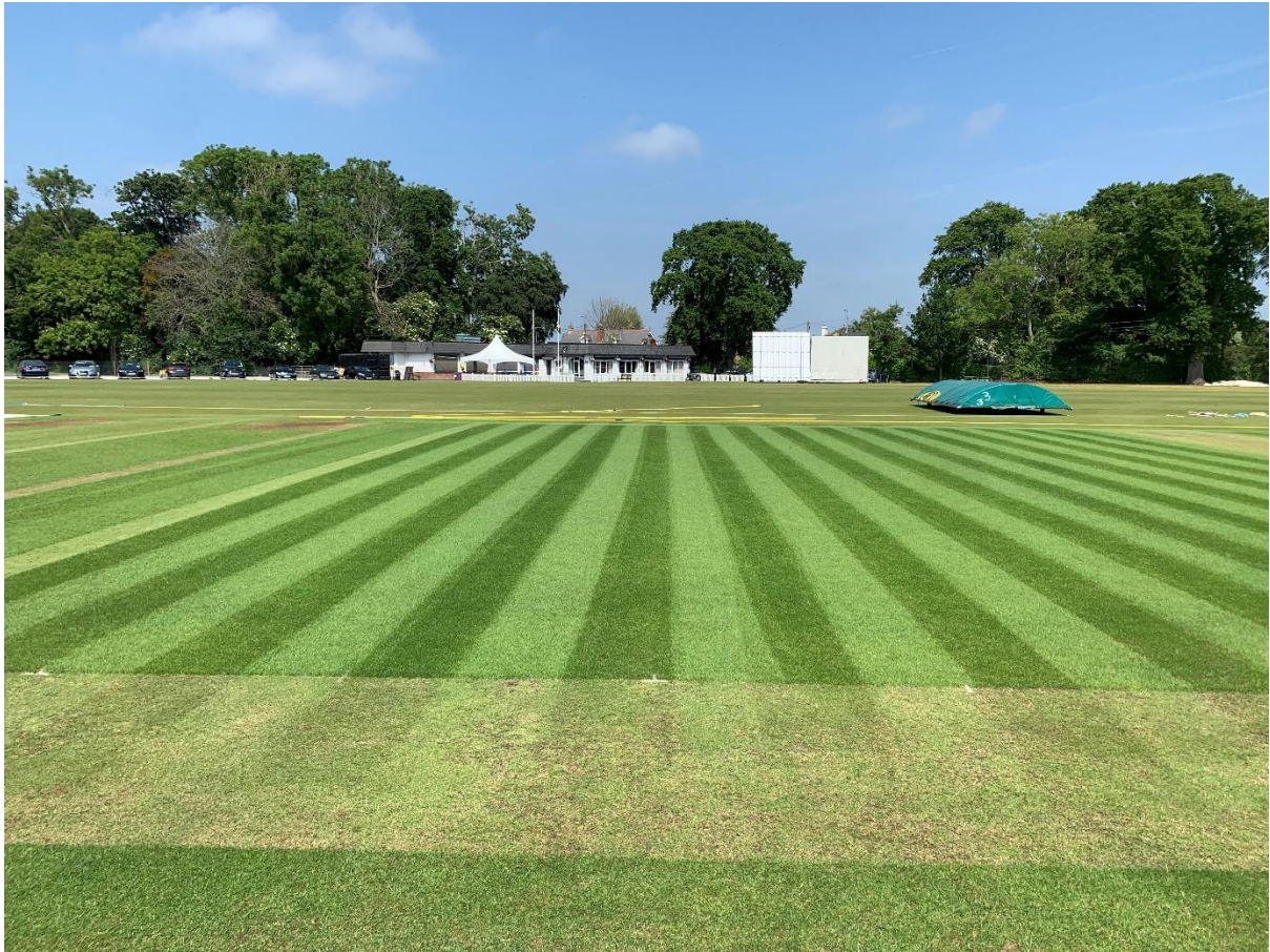
Centre tracks - 9 June