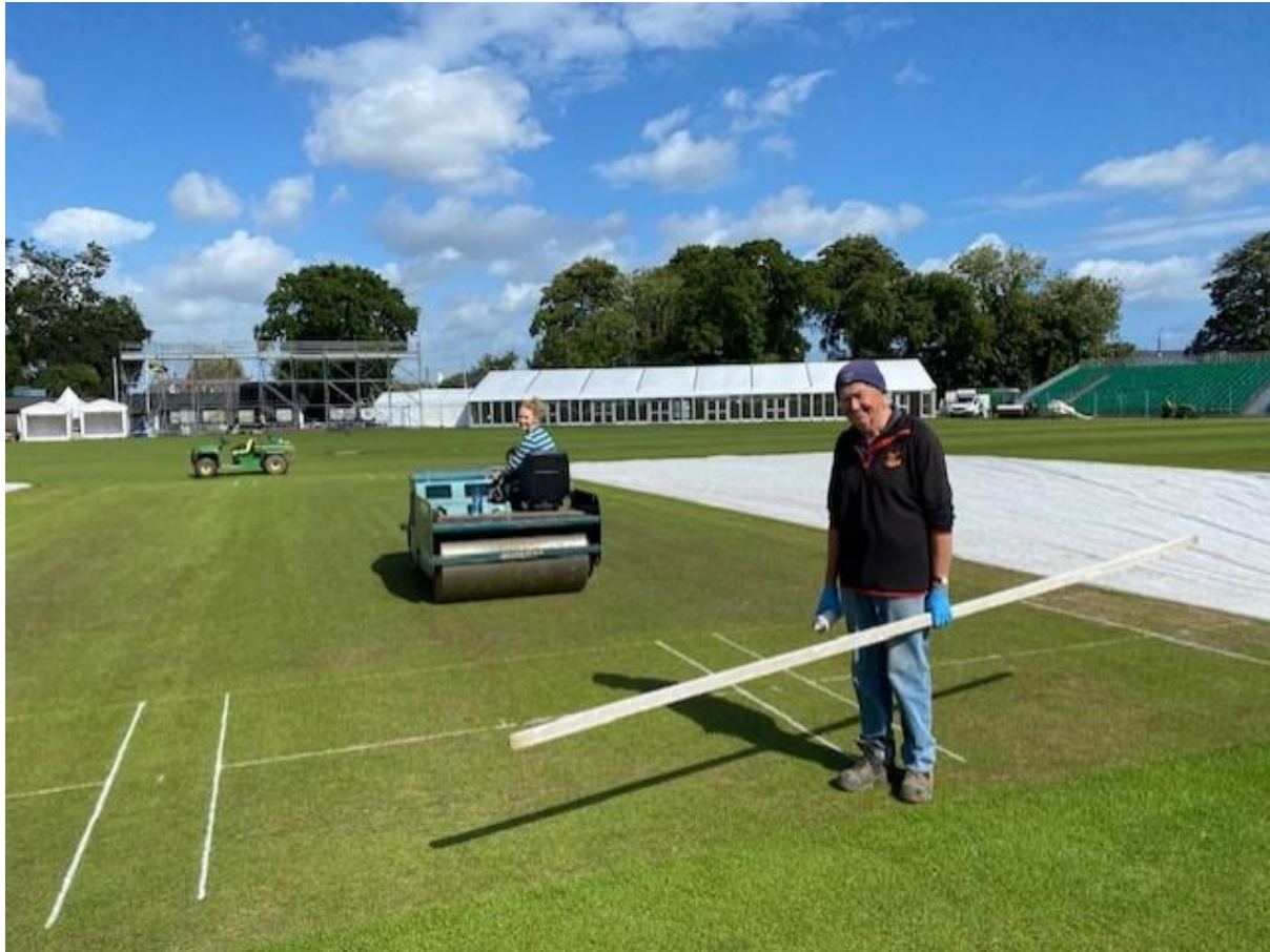
PF and assistant – 11 August

The rook issue has been resolved and the outfield is coming back to normal.