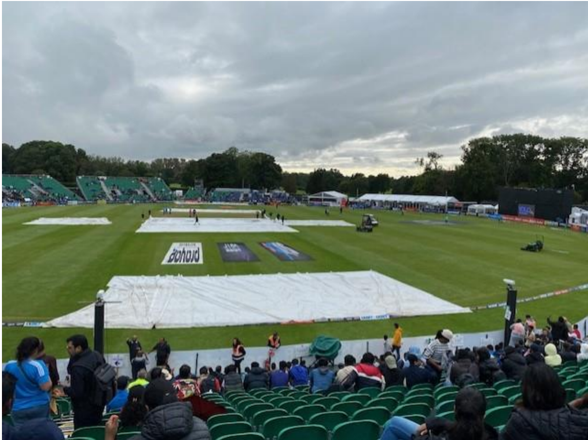
Match abandoned without play - 23 August