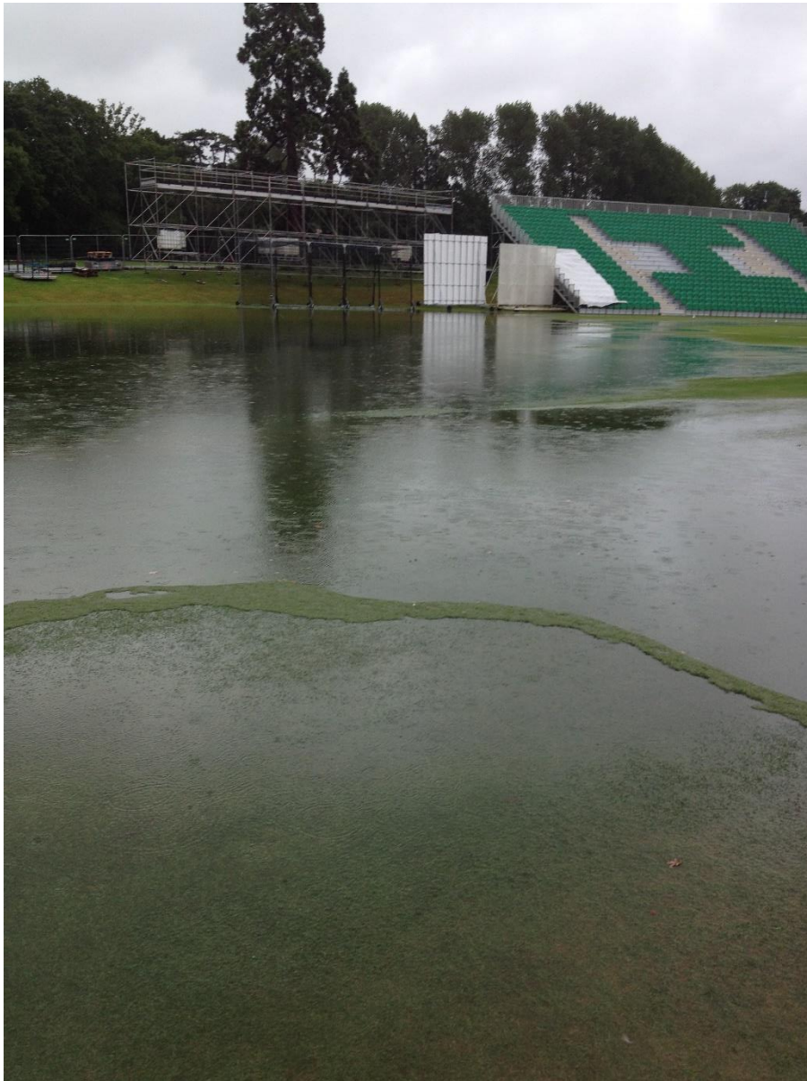
Waterlogged – 6 August