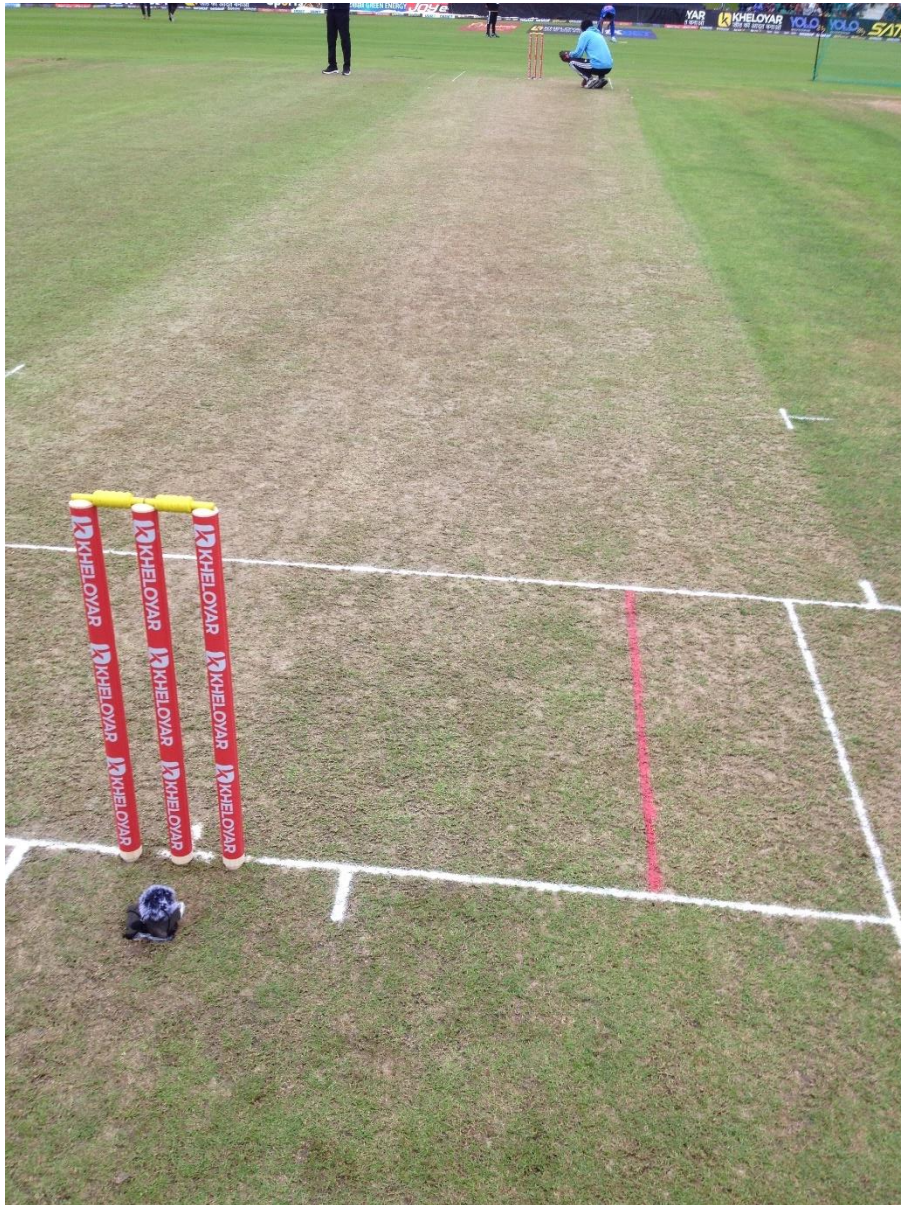
Wicket before start of play - 18 August